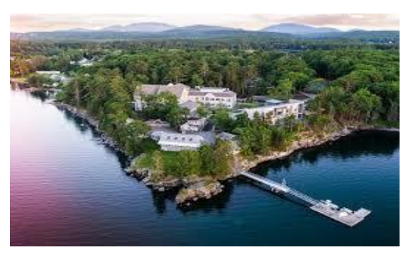
13<sup>th</sup> / 14<sup>th</sup> May 2022 MHH, Lecture hall H